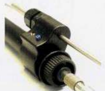
Adapter with push-switch

Orion-Industry 16, chemin de la Guy – Z.A. - 91160 Ballainvilliers